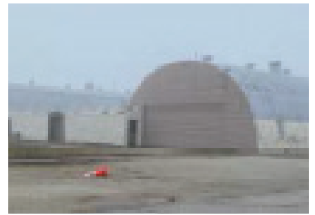
Quonset Huts, Willard Airport