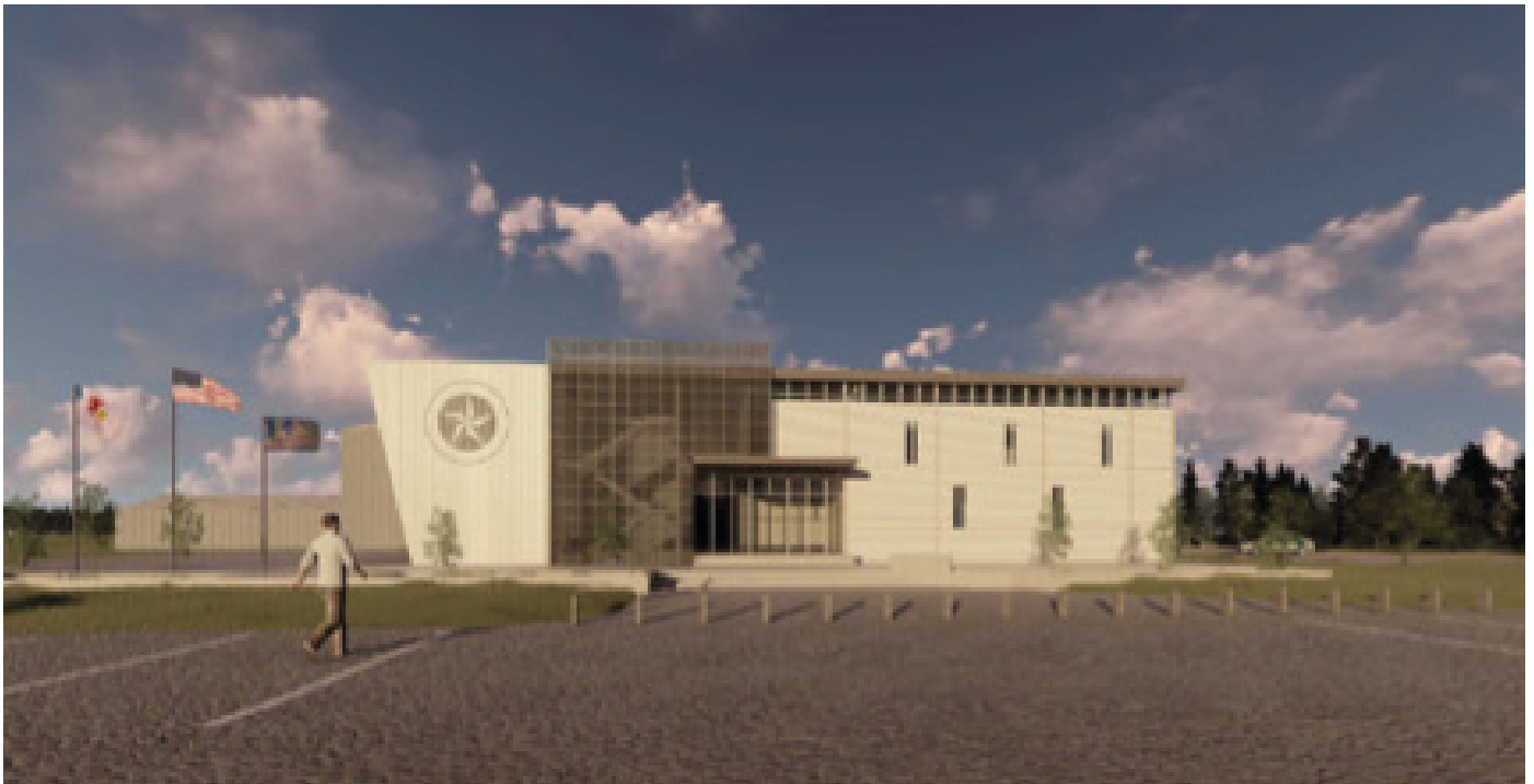
Phase Three: New Administrative Building

Our aim is to streamline operations and enhance our training capabilities. Your support in this endeavor is invaluable. We look forward to further discussions on this proposed expansion.