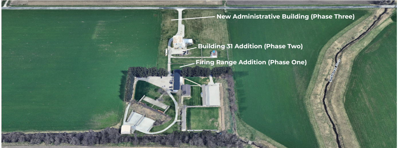
609 ½ E. Curtis Road, location of the proposed relocation and consolidation